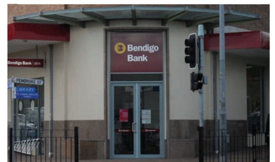
Top right: The official opening of the branch in North Epping, 2003. Middle: North Epping branch. Bottom: Oxford Street, Epping branch. Bottom left: Opening of the new premises in Epping.