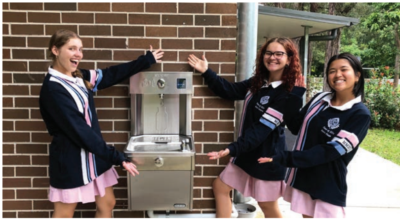
Above: Cheltenham Girls' school captain, vice-captain and prefect showing off the water station

Cheltenham Girls wanted to add an additional water station (cool filtered water to refill drink bottles) close to their new multi-purpose centre and sports oval. At Epping Boys, the bank gave a grant to install two additional flag poles – to display the Aboriginal and Torres Strait flags beside the Australian flag.