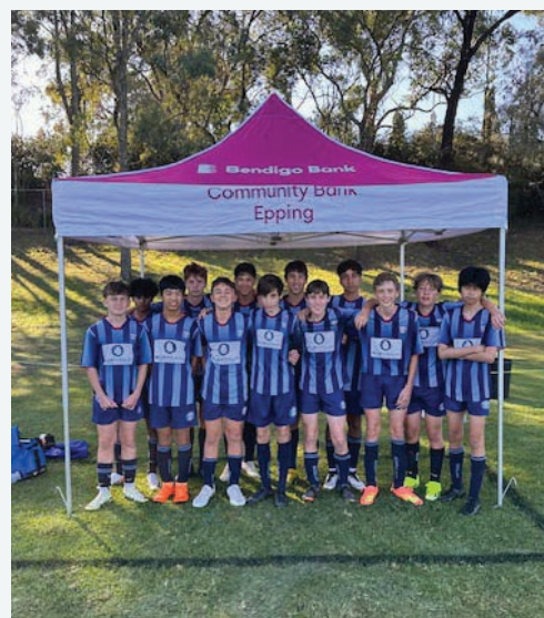
Roselea FC enjoying their new Bendigo marquee

As part of strategic planning for the branch, the Directors are always looking at ways to ensure that we continue to use our funding for a diverse range of groups. We aim to continue to help the local groups we have traditionally assisted but are also exploring new projects that will assist those less fortunate in our society. This may take the form of a longer-term activity or bigger project. We will update you on progress in future newsletters.