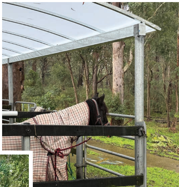
Bendy the horse staying dry in recent rain

Our grant not only funded the new covering, but also assisted with other smaller (but no less important) maintenance projects around the site. A very worthy cause indeed.