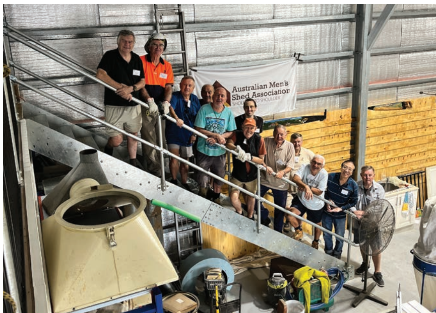
The Tuesday working team took a break to show off their efforts.

It's been a long haul, but the finish line is in sight. Members are now fitting out the inside of the shed and installing a big range of equipment. They are seen hard at work a few days each week and its hoped to have an official opening in coming months.