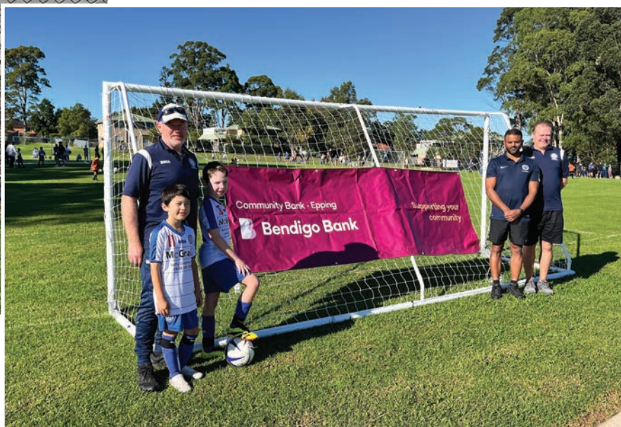
Above: Epping Eastwood Football Club Right from top: Tigers Baseball Club, Beecroft Football Club, Epping Football Club