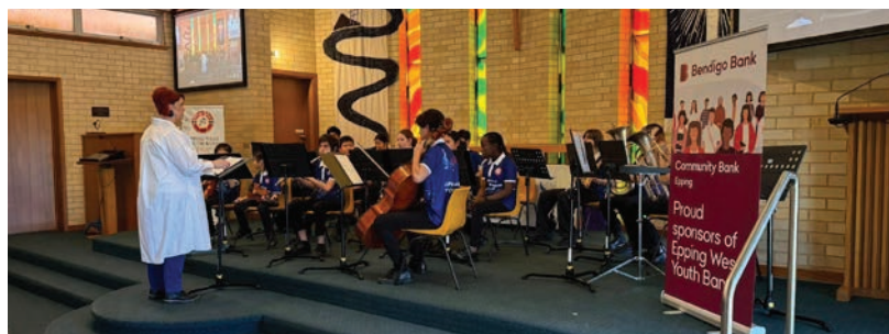
From top: Good Life Chorus, Macquarie Singers, Epping West Youth Band