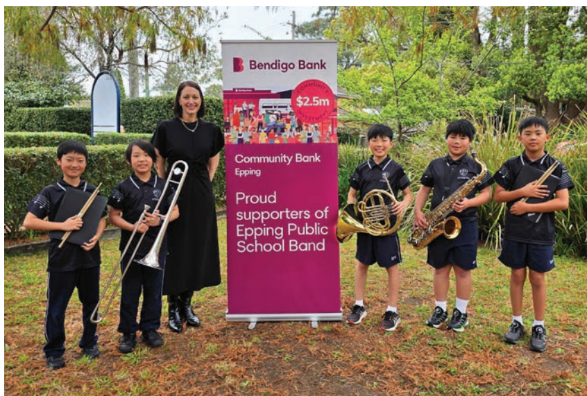
Left: Epping North PS community garden. Above: Epping Public School band. Below L-R: NextSense preschool, Murray Farm PS.

We recently funded new equipment for the West Epping Cricket Club, and we continue to sponsor Epping Bulls who play at Epping and North Epping ovals.