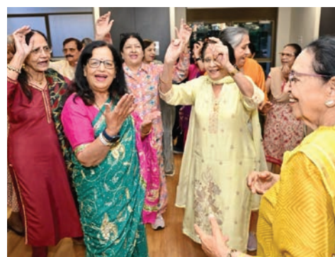
Captions... Top: Above L-R: